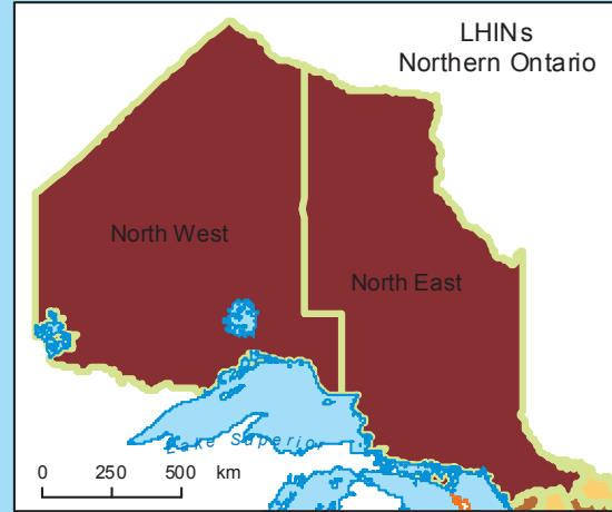
Age-Adjusted Hospitalization Rates for Medical Conditions per 1,000, Both Sexes All Ages, 2011-2012